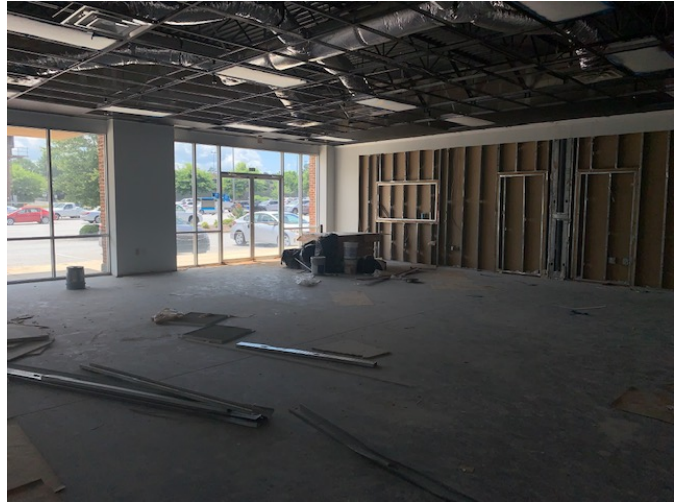
Suite 205 - Hiram Square