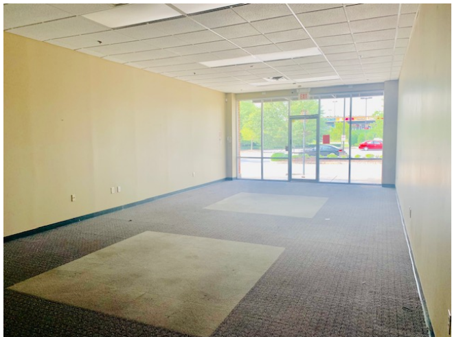
Suite 213 - Hiram Square