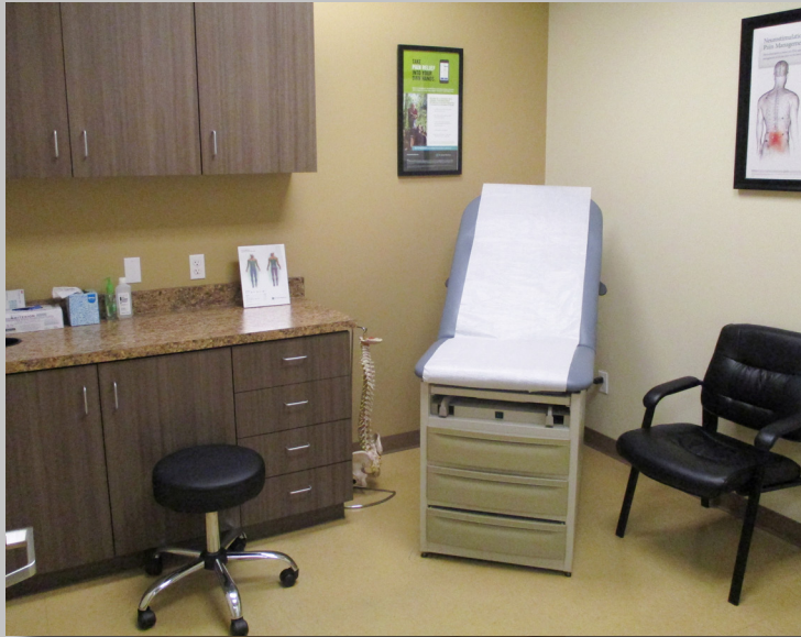
Existing Medical in Portion of Property

FOR SALE FOR LEASE: SHORT-TERM OFFICE SPACE AVAILABLE