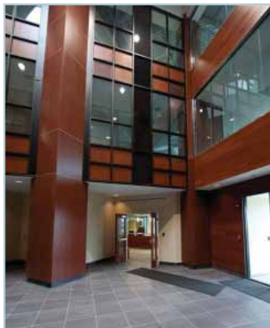
Beautiful, 3-story Lobby