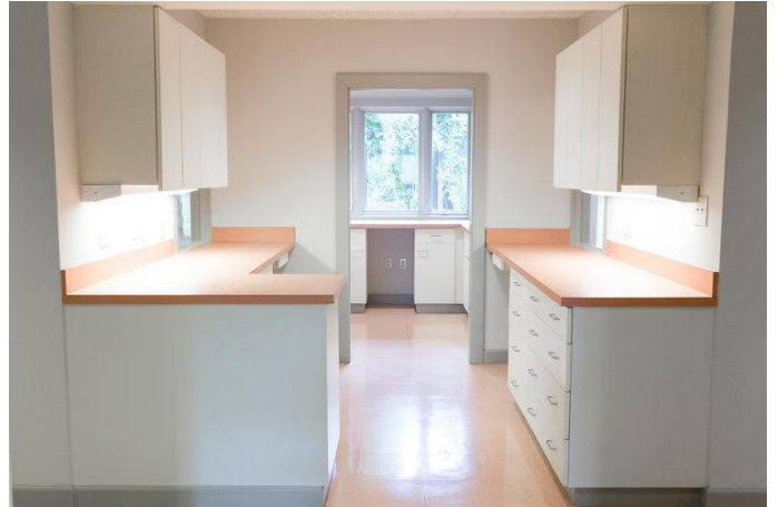
LAB / WORK STATIONS