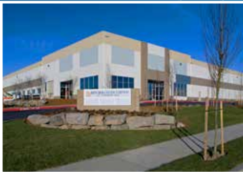
Building C - Current Availability

22887 NE TOWNSEND WAY FAIRVIEW, OREGON 97024