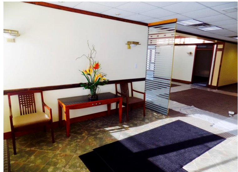
Waiting Room/Reception Area