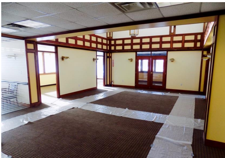
Multiple Private Offices