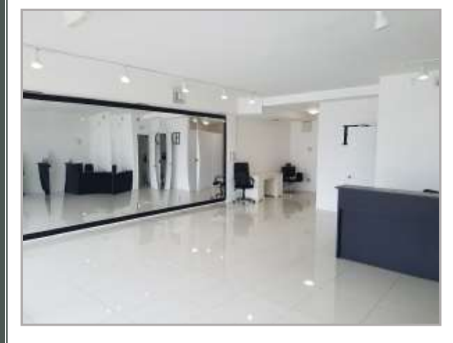
CLIENT TREATMENT AREA

2302 E Oakland Park Boulevard Fort Lauderdale, Florida 33306