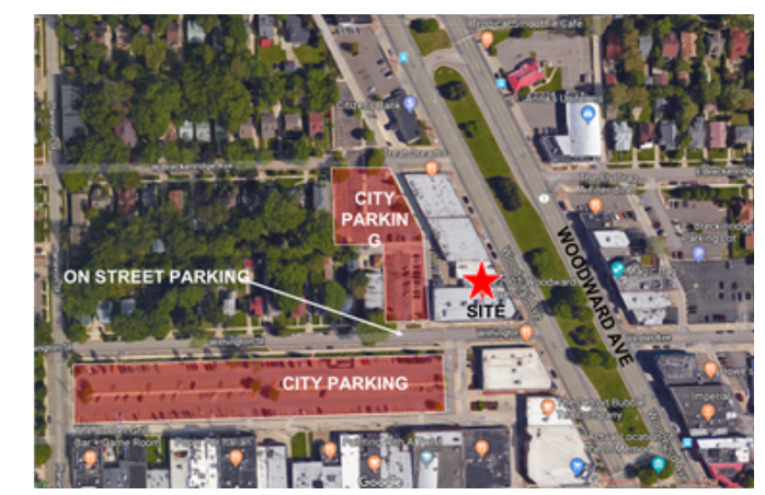
Local Parking Aerial