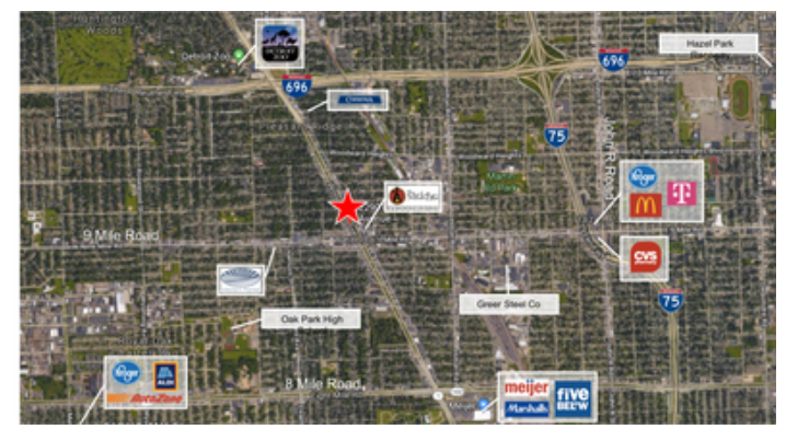
Aerial - Retail Area