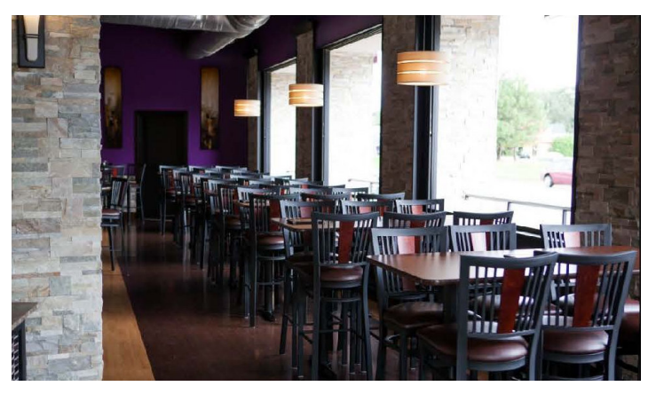
More Information Online