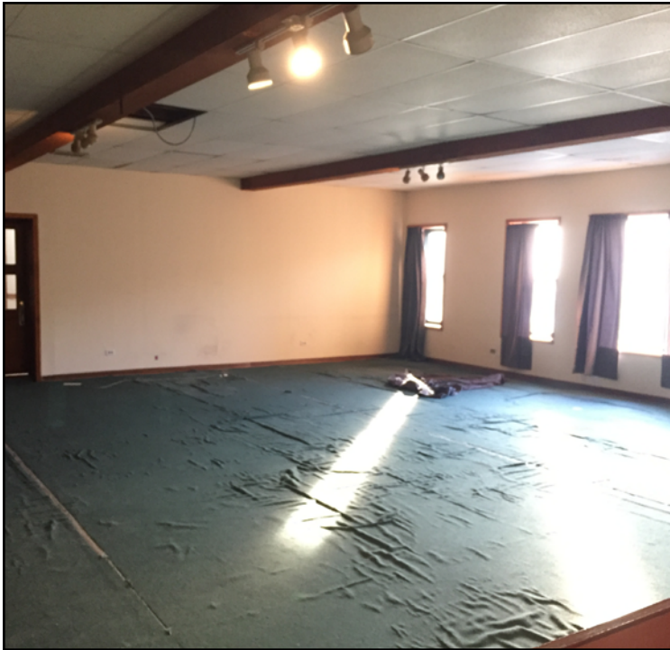
Large Open Area