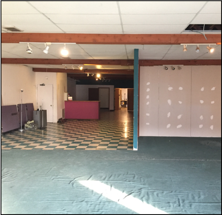
Large Open Area