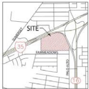
LOCATION MAP MAPSCO MAP GRID: 681C1 NOT TO SCALE

POTEET JOURDANTON, SWC 1-35 & HWY 16, SAN ANTONIO, TX