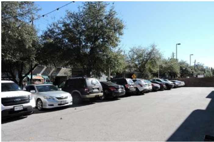
16 Parking Spaces