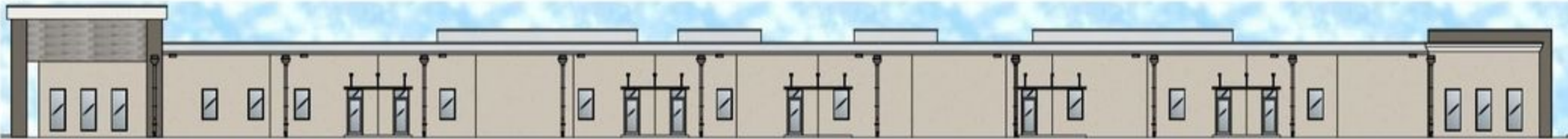
3 SOUTH ELEVATION Scale: 1/32" = 1'-0"