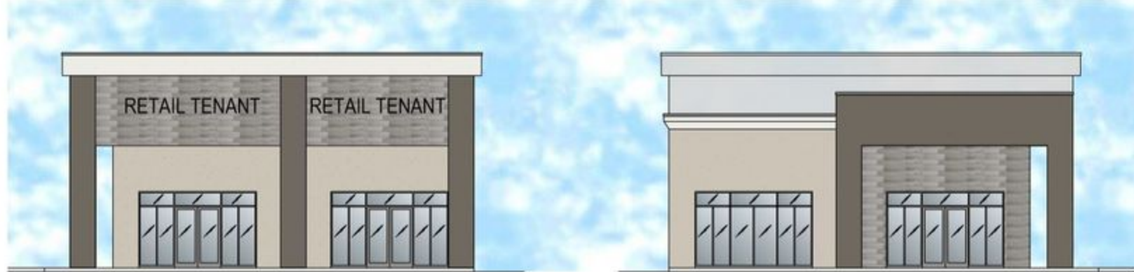
4 WESTS ELEVATION Scale: 1/8" = 1'-0"