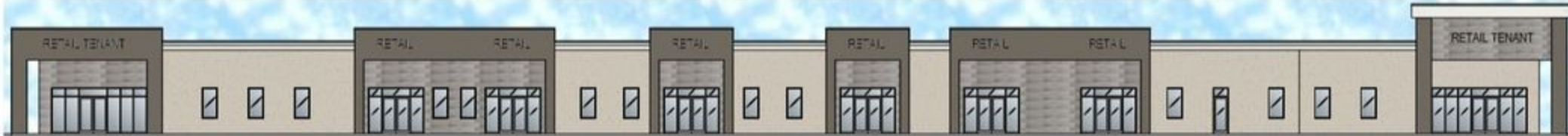
2 NORTH ELEVATION Scale: 1/32" = 1'-0"