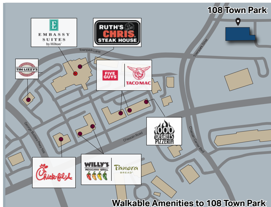
Walkable Amenities to 108 Town Park