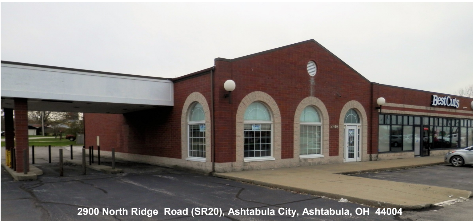
2900 North Ridge Road (SR20), Ashtabula City, Ashtabula, OH 44004