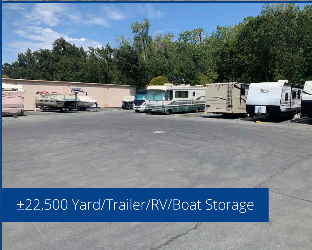
±22,500 Yard/Trailer/RV/Boat Storage