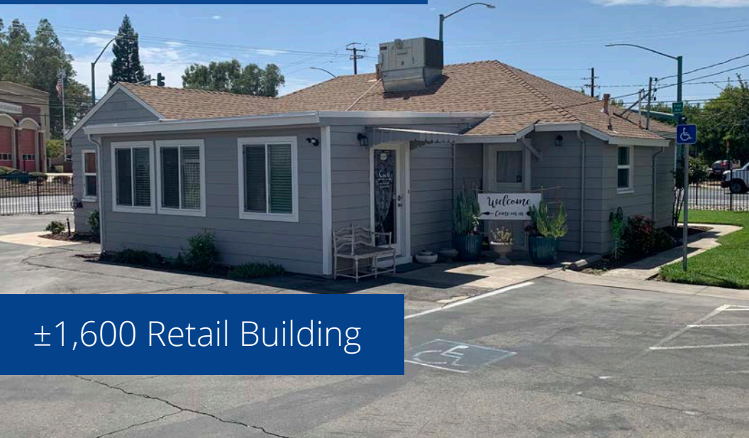
±1,600 Retail Building