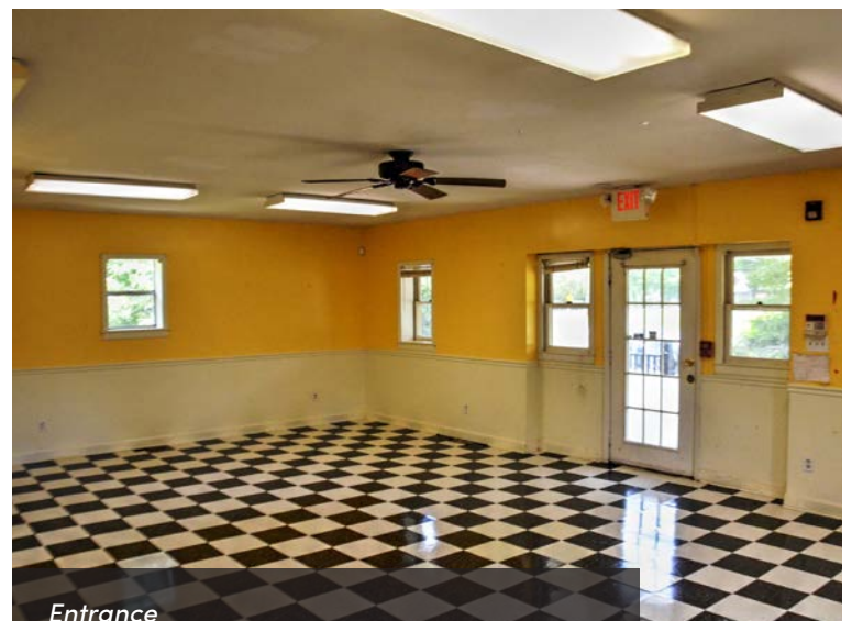
Entrance Activity Area #1