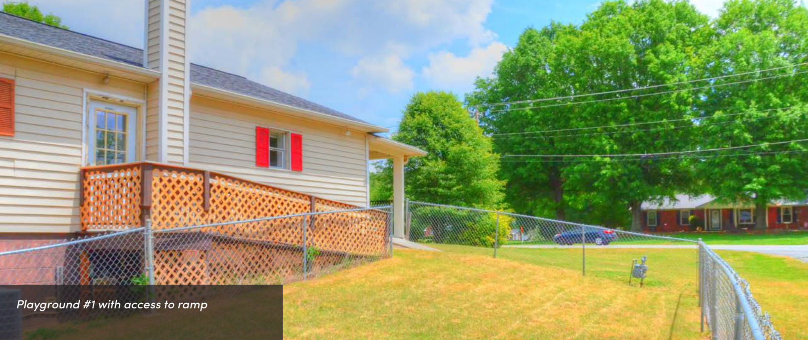
Playground #1 with access to ramp