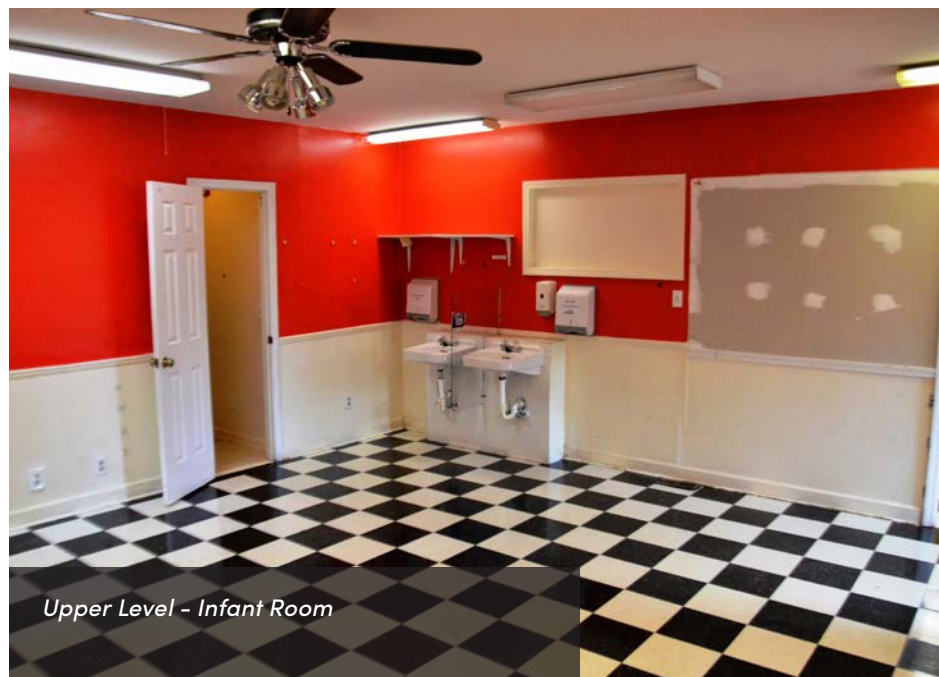
Upper Level - Infant Room