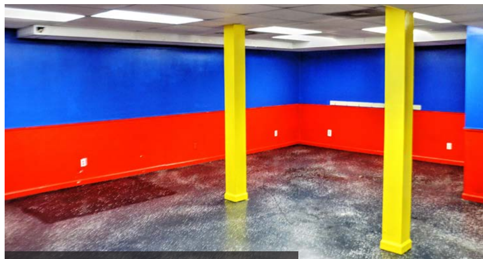
Lower Level - Activity Area #2