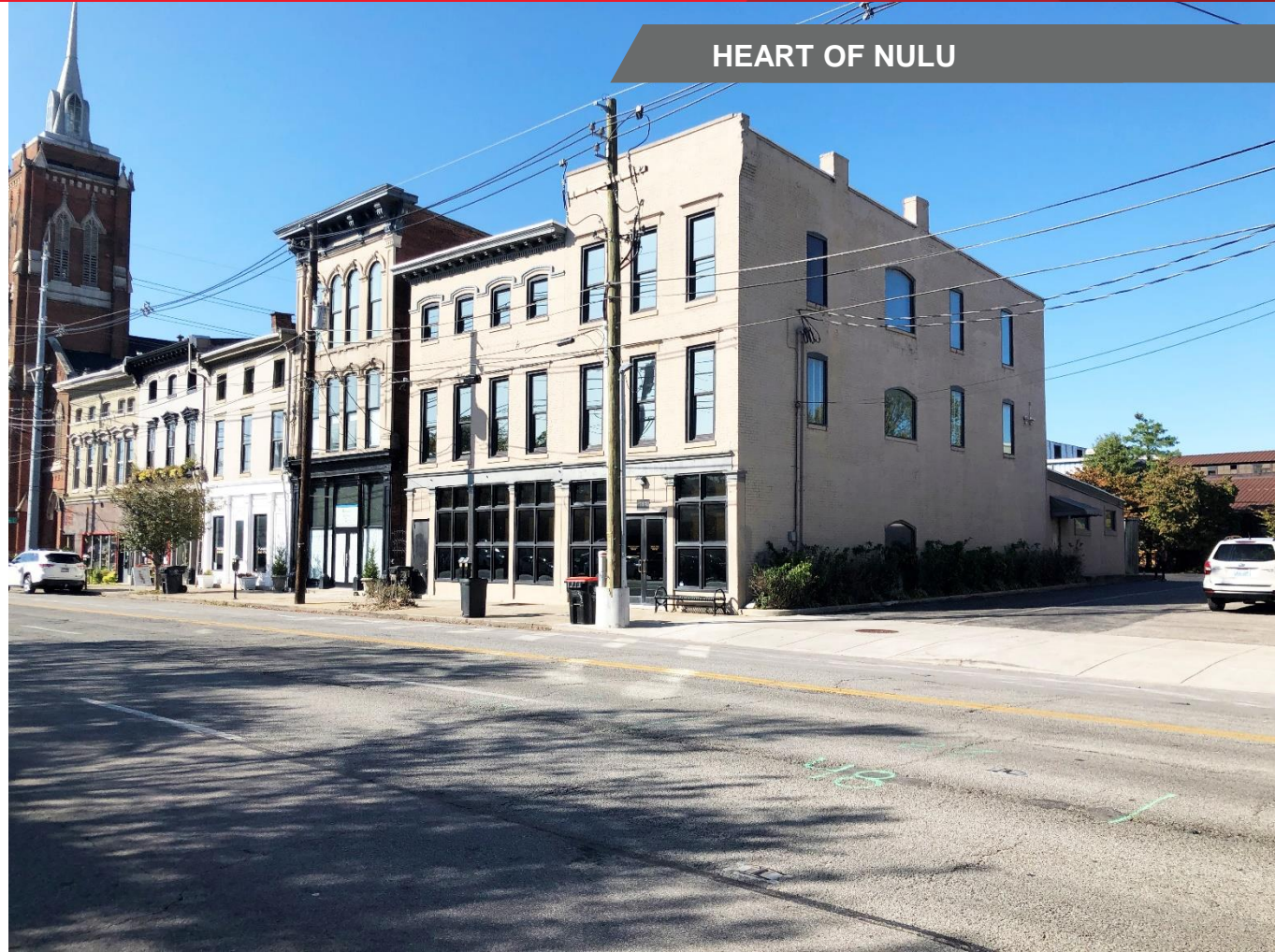
HEART OF NULU