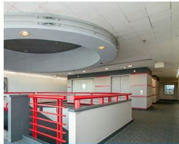
ONE (1) PASSENGER ELEVATOR