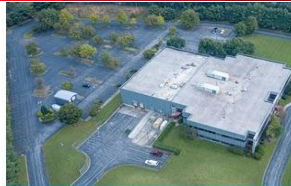
AMPLE PARKING | APPROX. 280 SPACES