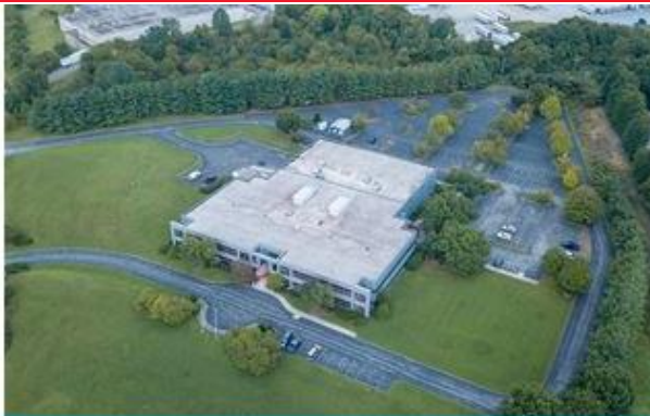
PRIME LOCATION WITHIN RCIT