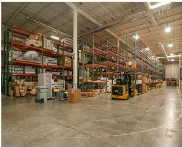
FULLY CONDITIONED WAREHOUSE