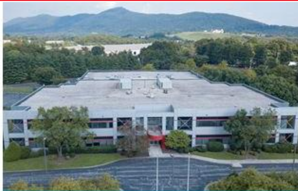
ROOF REPLACED IN 2016