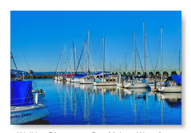
Walking Distance to Des Moines Waterfront