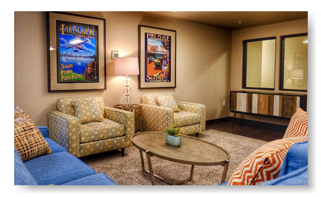
Adriana Community Room

The Adriana 22525 7th Ave S | Des Moines, WA 98198