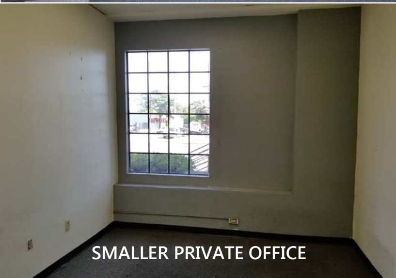
SMALLER PRIVATE OFFICE