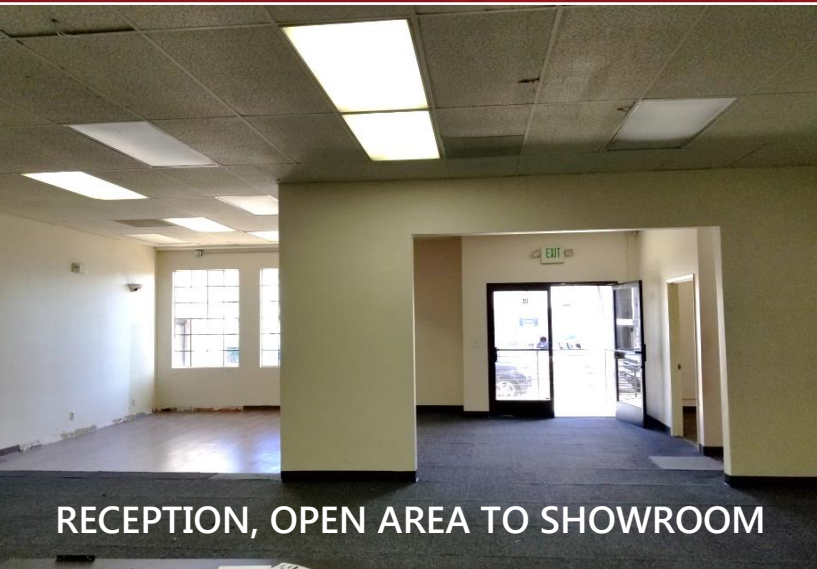
RECEPTION, OPEN AREA TO SHOWROOM