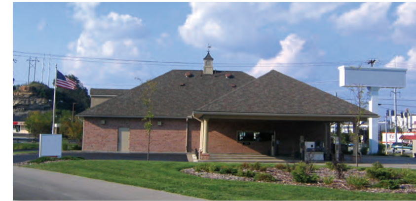
Newly Available Pad Building