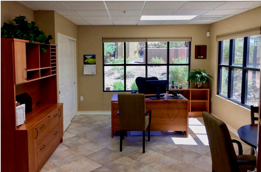
Sundance Gardens Office Center