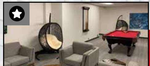
TENANT LOUNGE with pool table