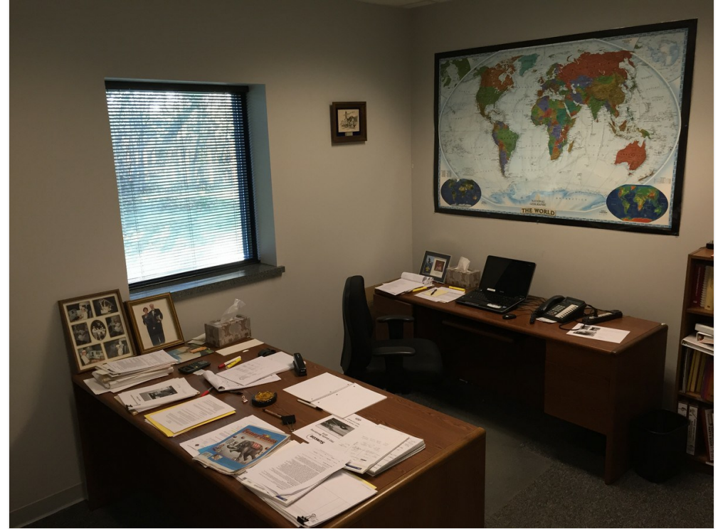
721 Suite one of 5 offices