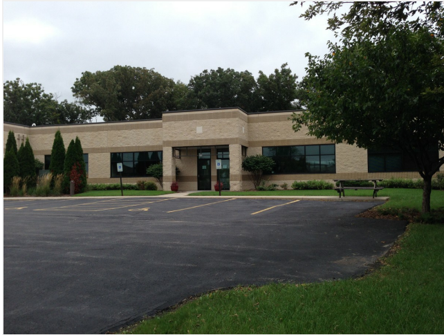
721 Suite - Front view with large parking lot

721 Cornerstone Crossing, Waterford, WI 53185