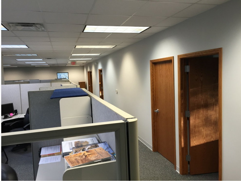
721 Suite row of 5 offices next to 15 cubicles