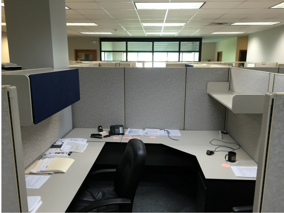
721 Suite cubicle detail view 2