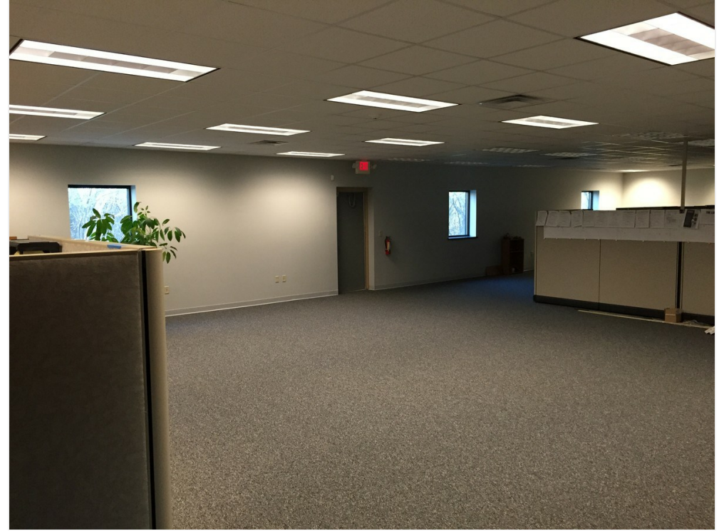
721 Suite open/flex area for 6 more cubicles or light manufacturing/assembly