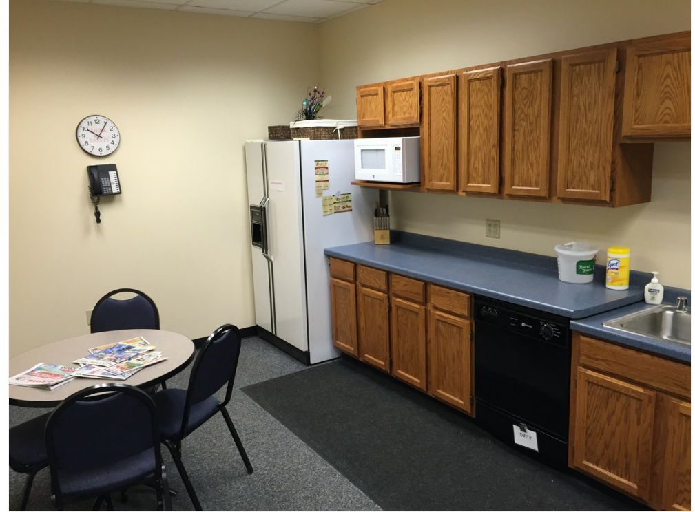
721 Suite kitchen with Refrig / Dishwasher / Sink