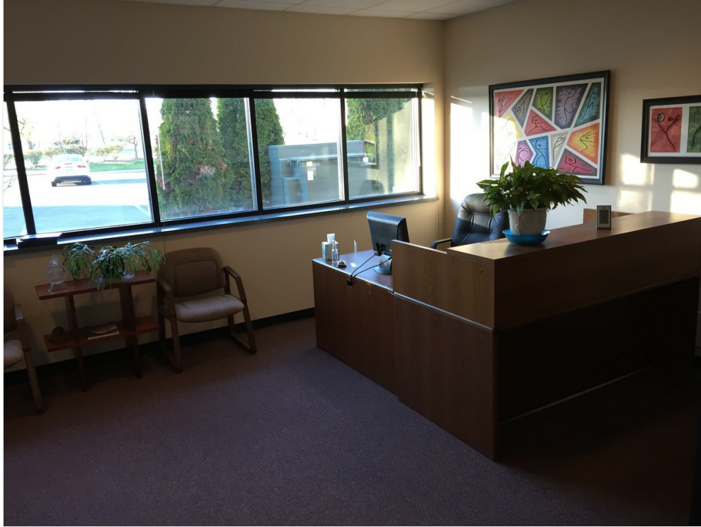
721 Suite Front reception desk