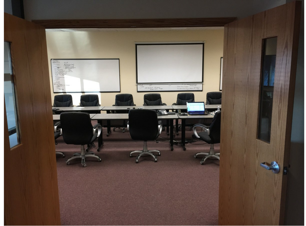
721 Suite large conference room 20-25 ppl