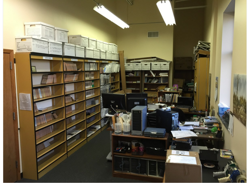
721 Suite storage/shipping area by back door