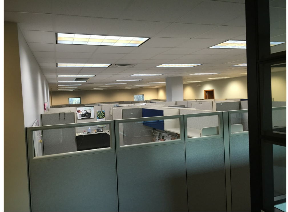
721 Suite 15 cubicles view from front employee entrance