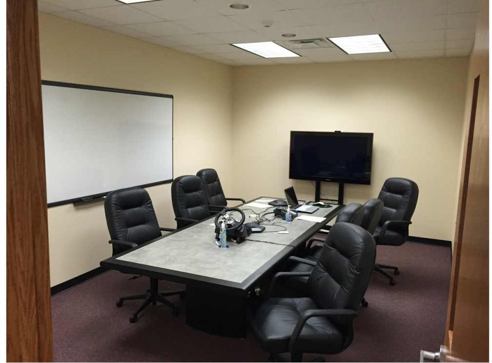
721 Suite small conference room