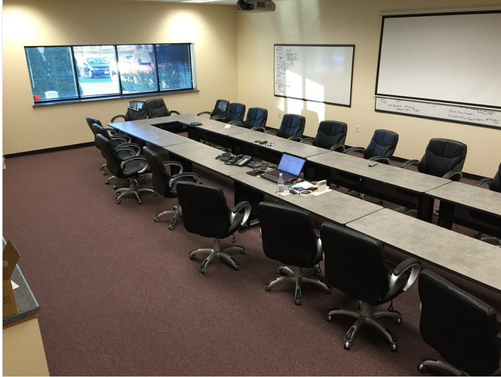
721 Suite conference room facing front of bldg