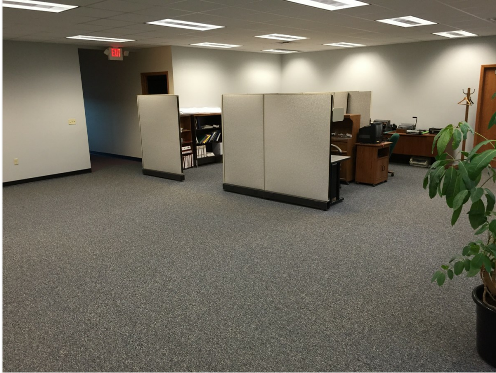
721 Suite open/flex area / open area 2nd view