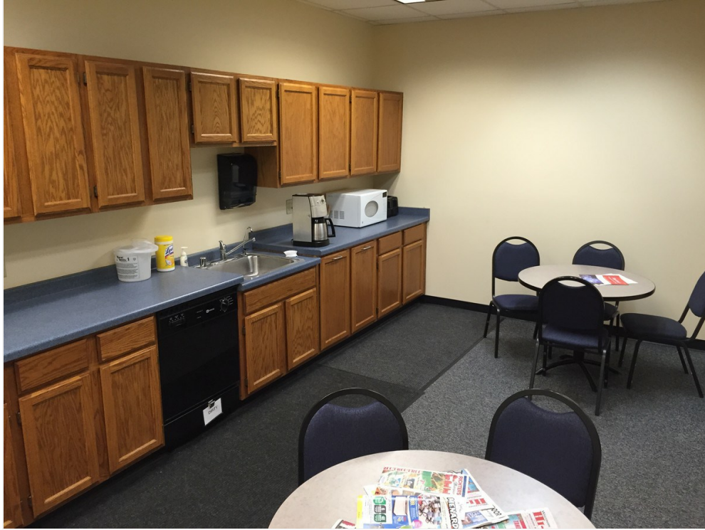
721 Suite kitchen additional view