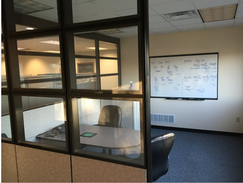
721 Suite meeting area with front windows