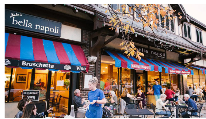
Brookside shops located .5 mile away from site; walkable from the Trolley Tail.