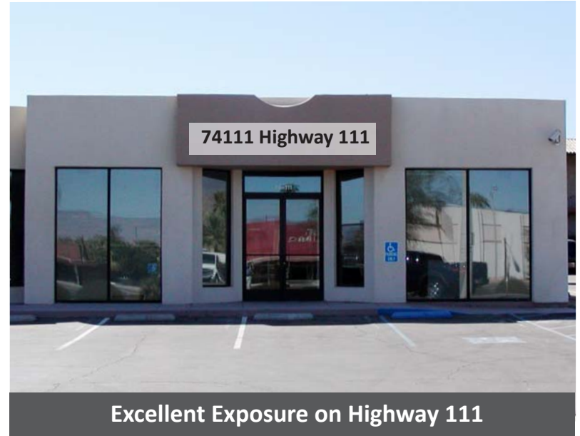
Excellent Exposure on Highway 111