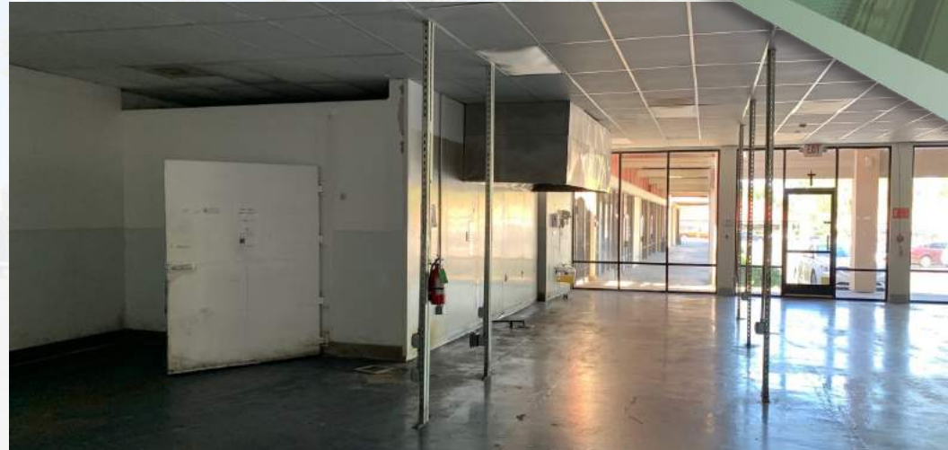
Suite R - \pm 4,500 SF 2nd Generation Restaurant (Divisible to \pm 2,000 - 2,500 SF)