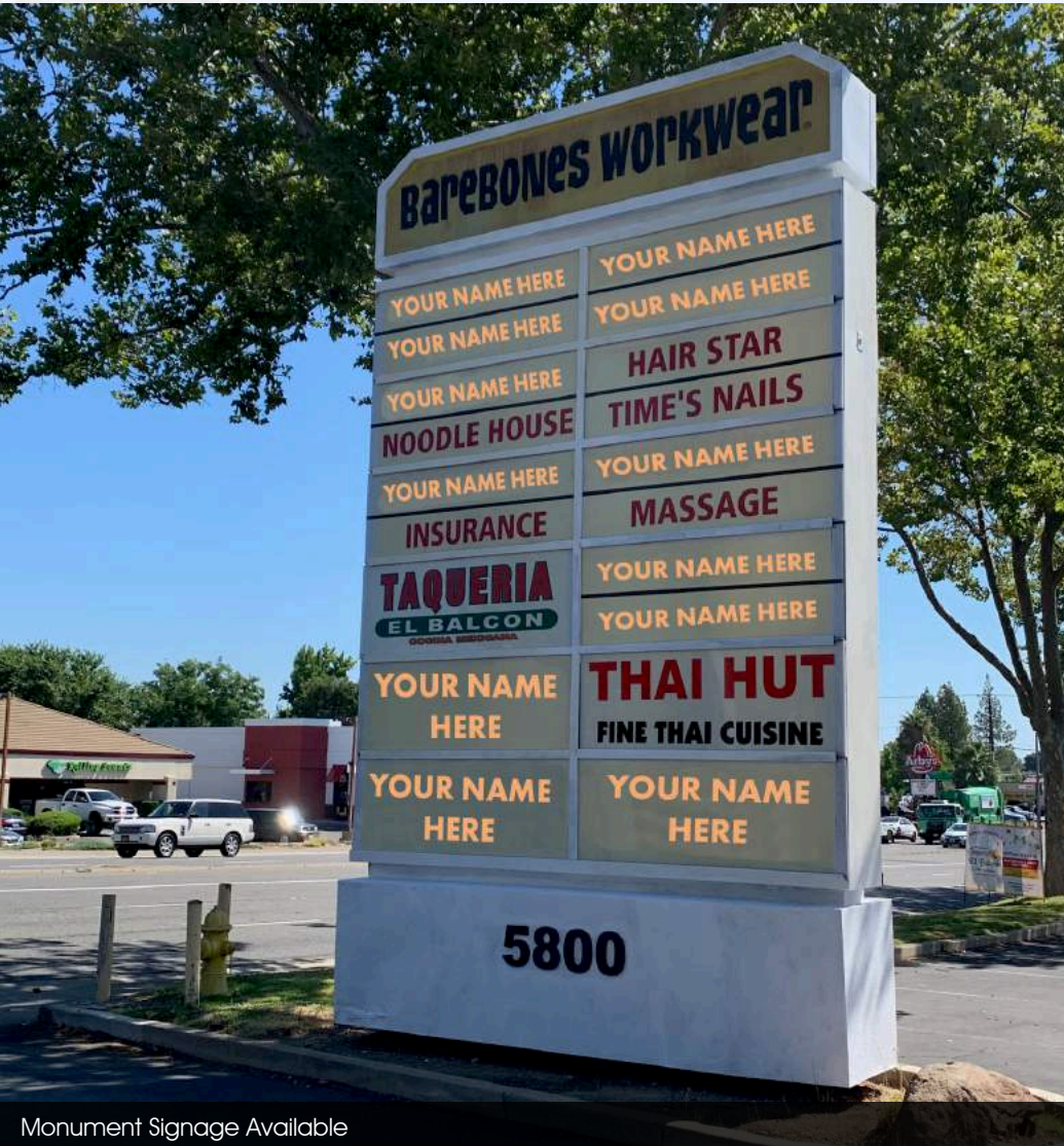
Monument Signage Available