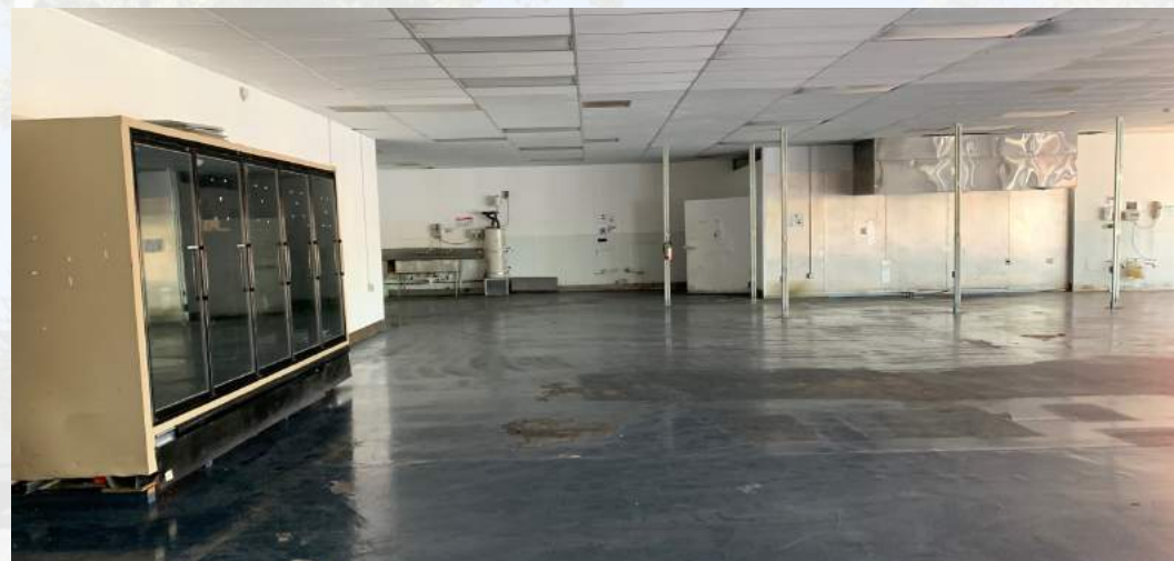
Suite R - \pm 4,500 SF 2nd Generation Restaurant (Divisible to \pm 2,000 - 2,500 SF)