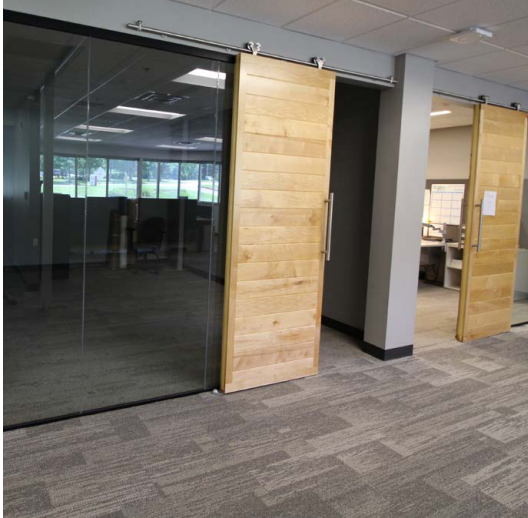
Offices with Barn Doors