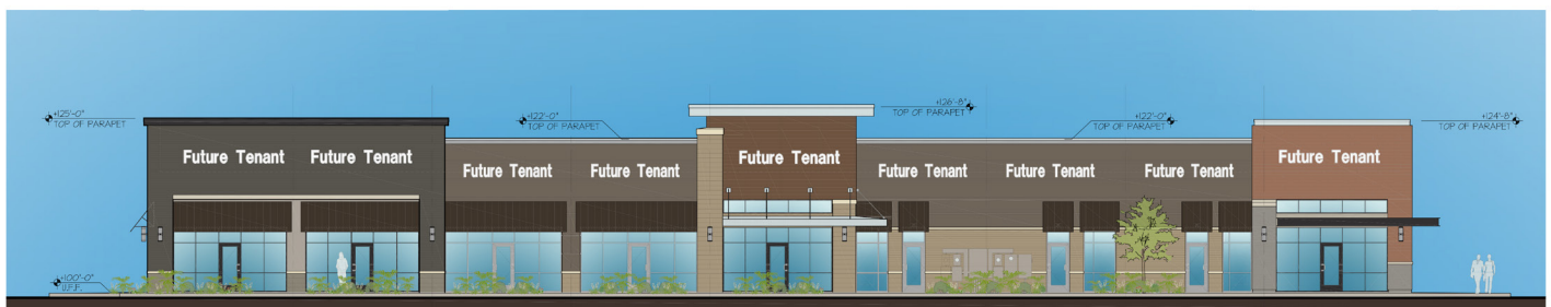
1 SOUTH (Street) ELEVATION SCALE: 3/32" = 1'-0"