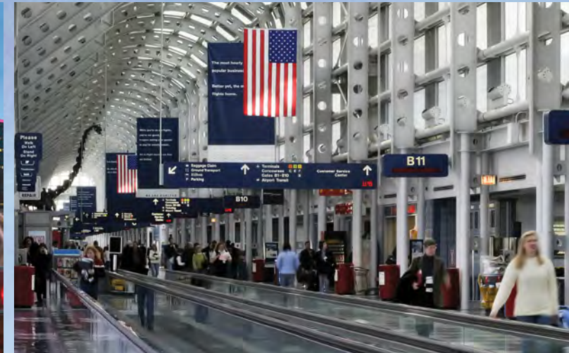
O'Hare International Airport