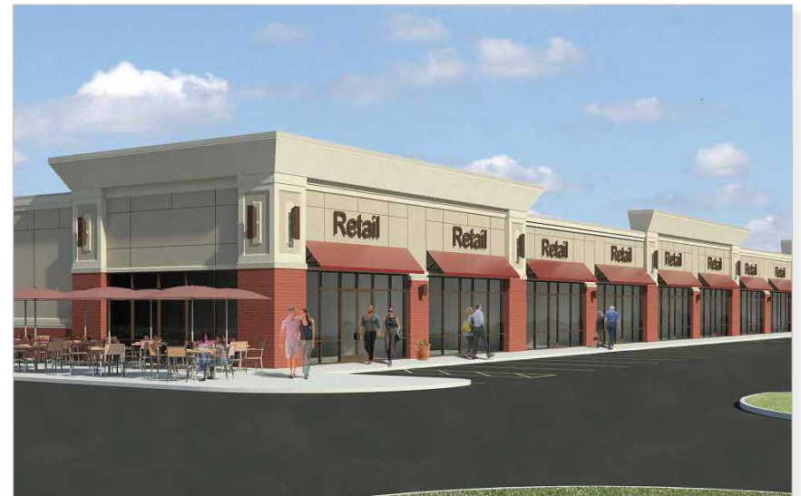
Proposed artist's rendering