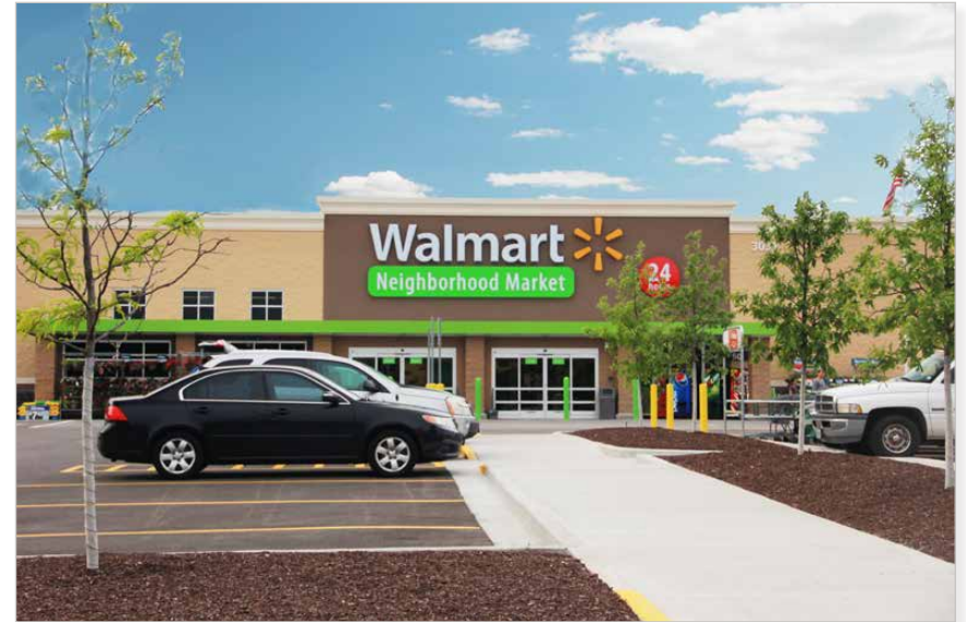
Existing Walmart Neighborhood Market & Gas Station

PATRICIA MCKELVEY 636.448.1294 pmckelvey@mckelveyproperties.com