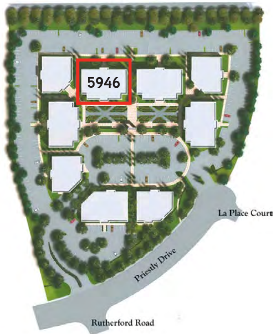
El Camino Real