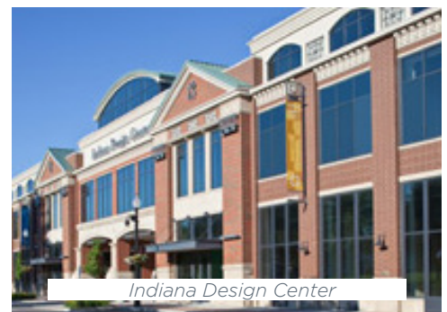
Indiana Design Center