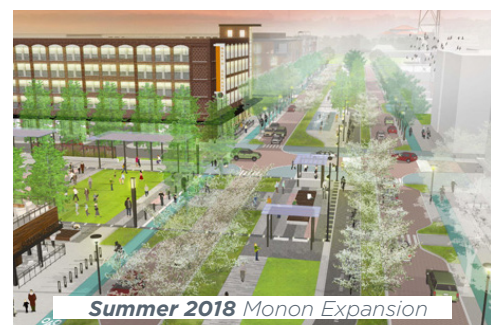
Summer 2018 Monon Expansion