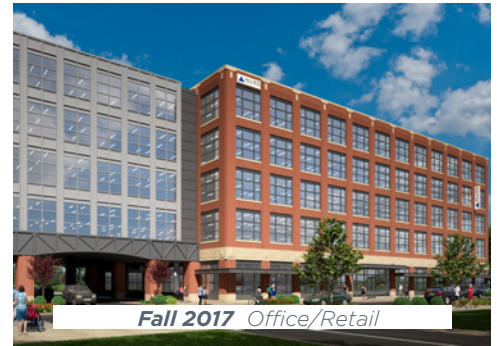
Fall 2017 Office/Retail