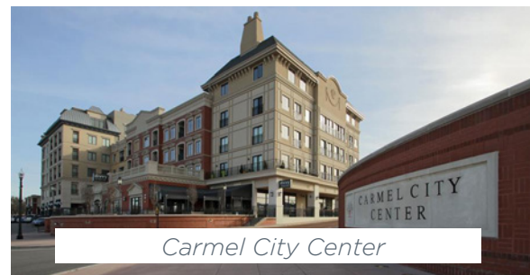
Carmel City Center