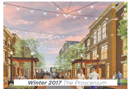
Winter 2017 The Proscenium