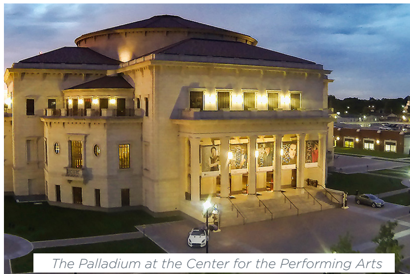
The Palladium at the Center for the Performing Arts