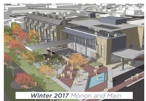
Winter 2017 Monon and Main