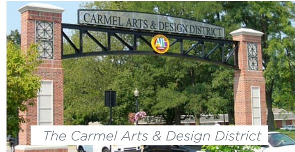
The Carmel Arts & Design District