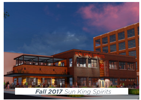
Fall 2017 Sun King Spirits