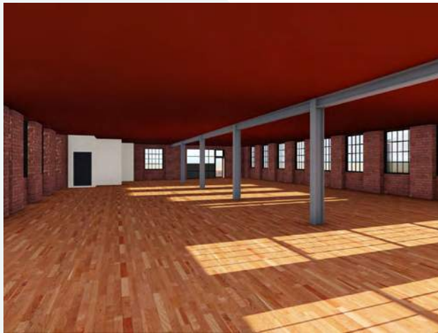
RUBEN BLDG CROSS STREET ENTRANCE

THE UNION BROTHERS PROPERTY is a unified set of 3 connected buildings. Each offers unique configuration and build-to-suit opportunities across 3 stories, including a ground level patio.