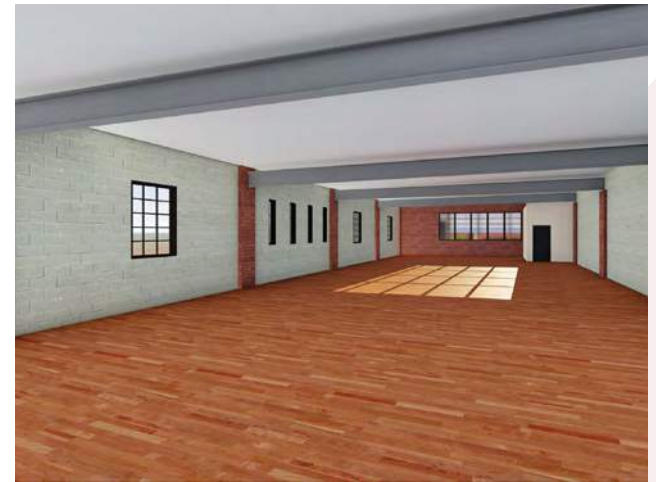
BENJAMIN BLDG HANOVER STREET ENTRANCE

FIRST FLOOR - 1,859 SF SECOND FLOOR - 1,886 SF FEET THIRD FLOOR - 1,887 SF