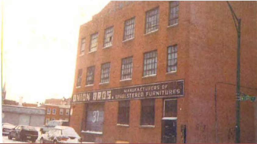
UNION BROS. BUILDING IN THE 1970'S

THE UNION BROS. FURNITURE BUILDING is a 2 and 3 story brick factory building constructed in three distinct sections between 1923 and 1955. It was originally built to house the Union Bros. Furniture Company, a local enterprise whose rapid growth paralleled Baltimore's own growth as a center of manufacturing. Historically, the building has always been used as a mixed-use warehouse and retail hub - a tradition being revived today.