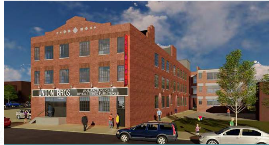
FUTURE OF THE UNION BROS. BUILDING