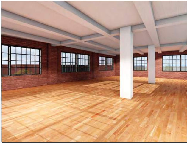
PHILLIP BLDG CLARKSON STREET ENTRANCE

RESTAURANT W/ 1,200 SF ROOFTOP DECK - 6,057 SF SECOND FLOOR - 5,883 SQ FEET THIRD FLOOR - 5,924 SQ FEET