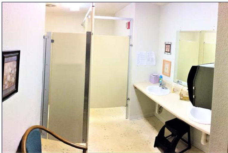
ADA restrooms with showers