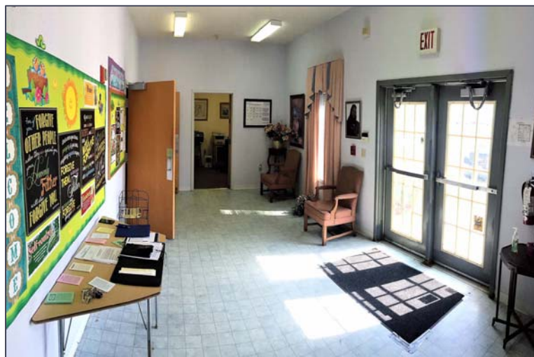
Lobby and front office area