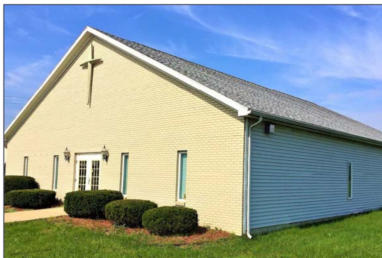
3,500 square feet on 4 acres