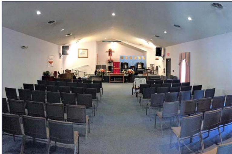
Congregation/Open floor with 14' ceilings