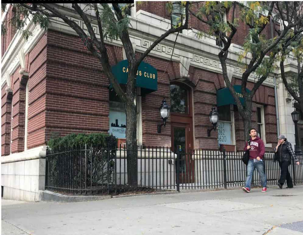
40' OF FRONTAGE ON BOYLSTON