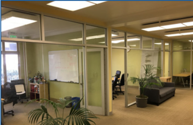
Suite 350: Private Offices with Glass Façade