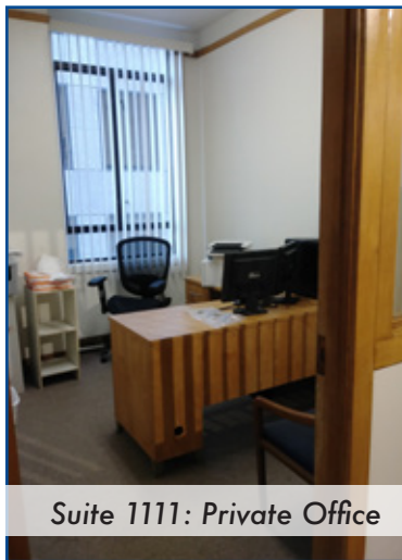
Suite 1111: Private Office