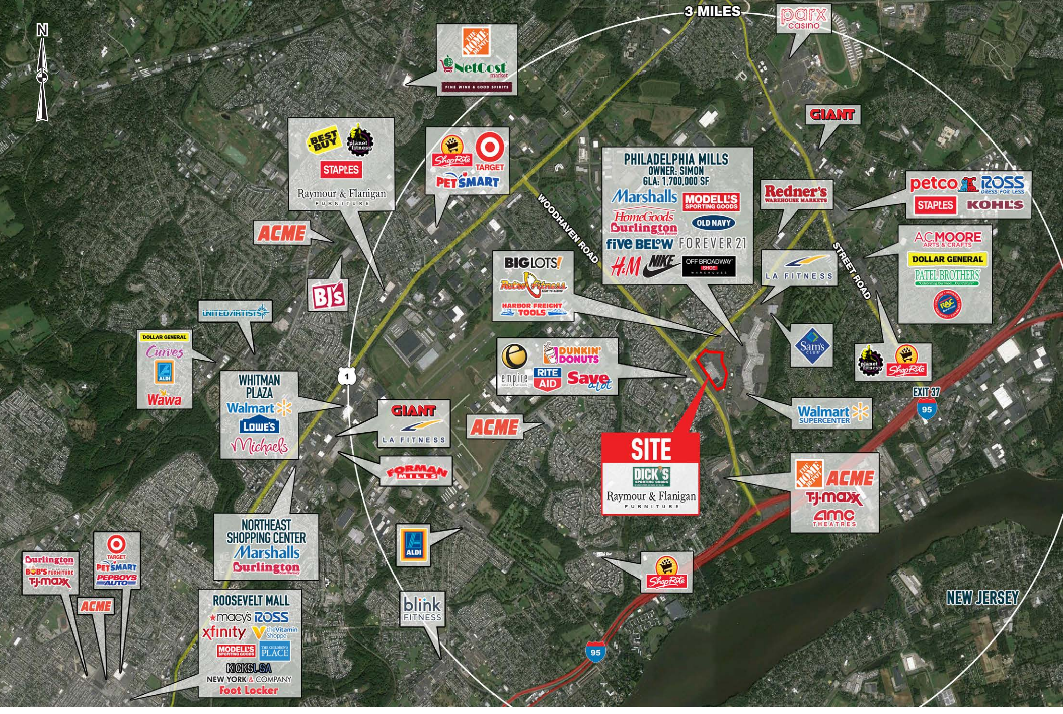
The information and images contained herein are from sources deemed reliable. However, Metro Commercial Real Estate, Inc. makes no representation whatsoever as to their accuracy or authenticity. Images shown may be modified for illustrative purposes. Images may be out-of-date and not current. 11.12: