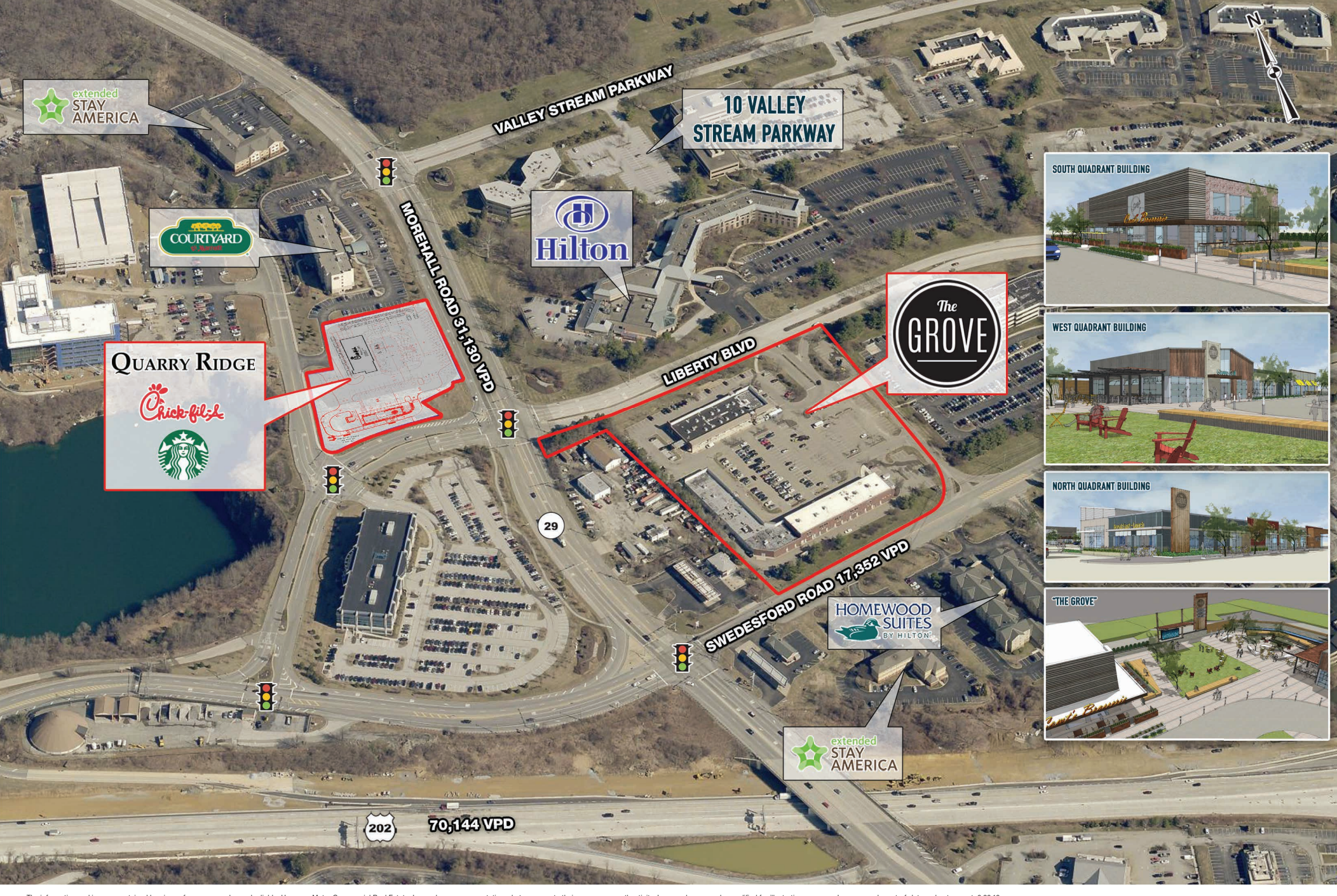
The information and images contained herein are from sources deemed reliable. However, Metro Commercial Real Estate, Inc. makes no representation whatsoever as to their accuracy or authenticity. Images shown may be modified for illustrative purposes. Images may be out-of-date and not current. 9.28