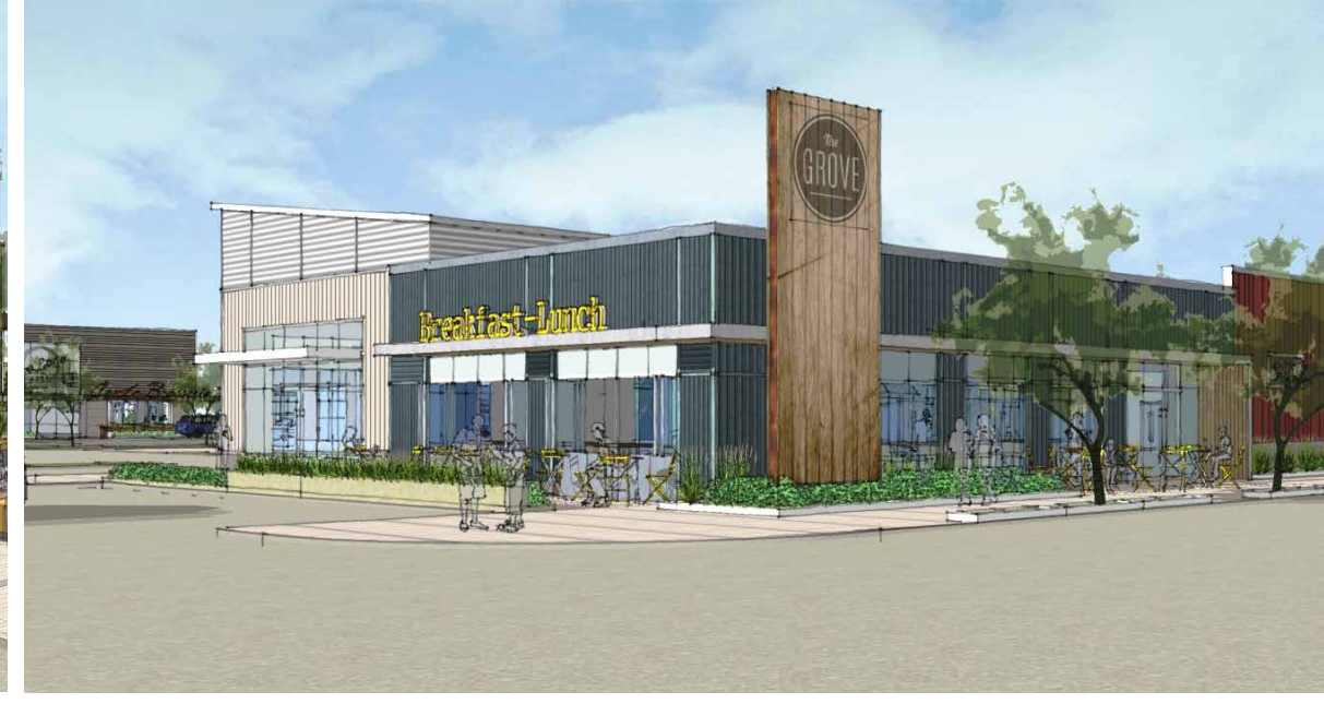
The information and images contained herein are from sources deemed reliable. However, Metro Commercial Real Estate, Inc. makes no representation whatsoever as to their accuracy or authenticity. Images shown may be modified for illustrative purposes. Images may be out-of-date and not current. 9.28