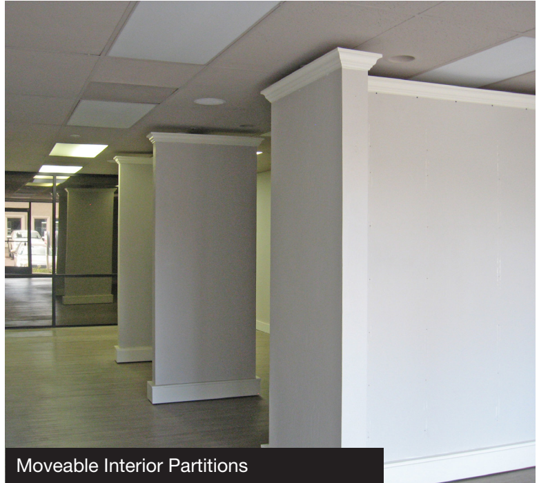
Moveable Interior Partitions