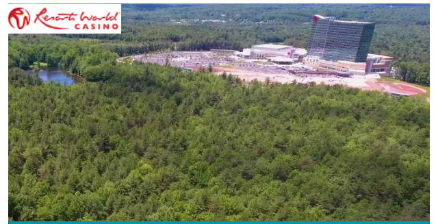
Aerial View of Resorts World Casino

The amount of annual visitors to the area is expected to increase to 4 million by 2022. Total job creation from both the casino and the hotel/waterpark is expected to exceed 2,100 direct employees.