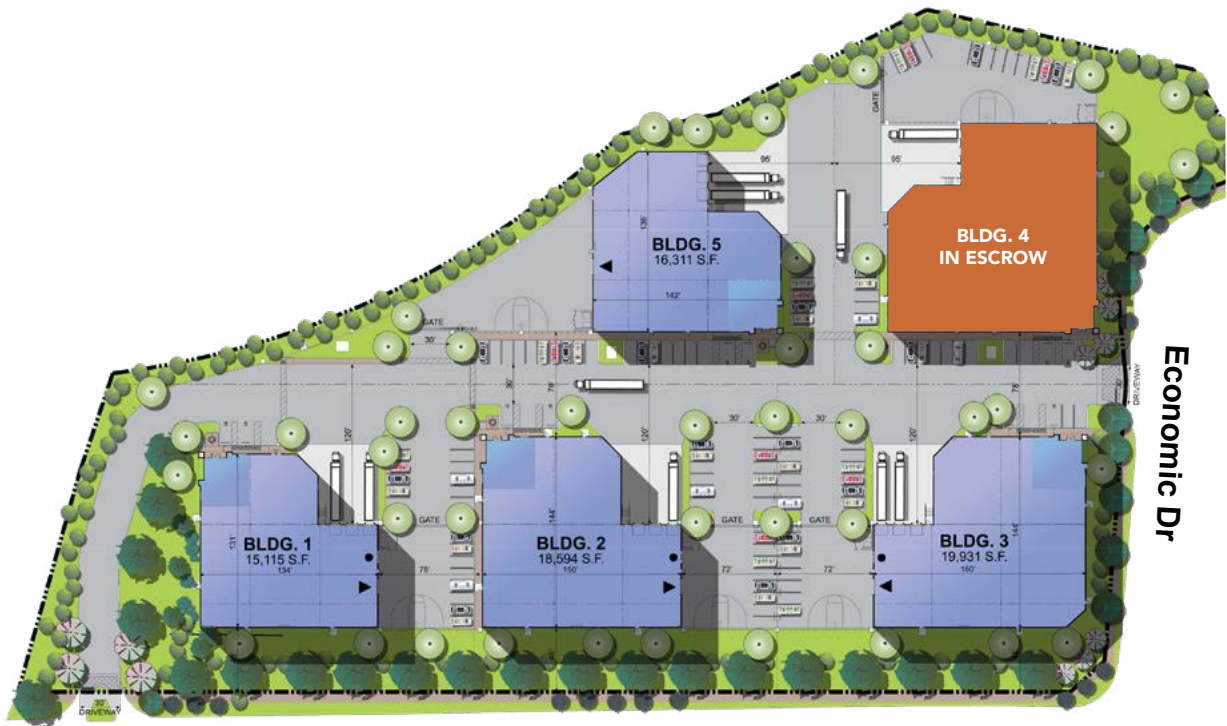
Van Buren Blvd