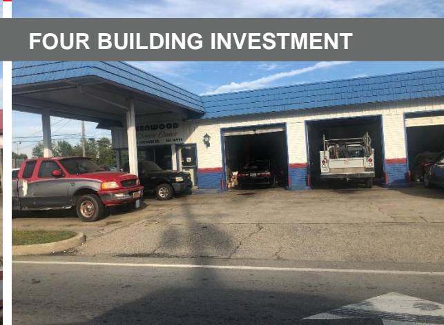
FOUR BUILDING INVESTMENT