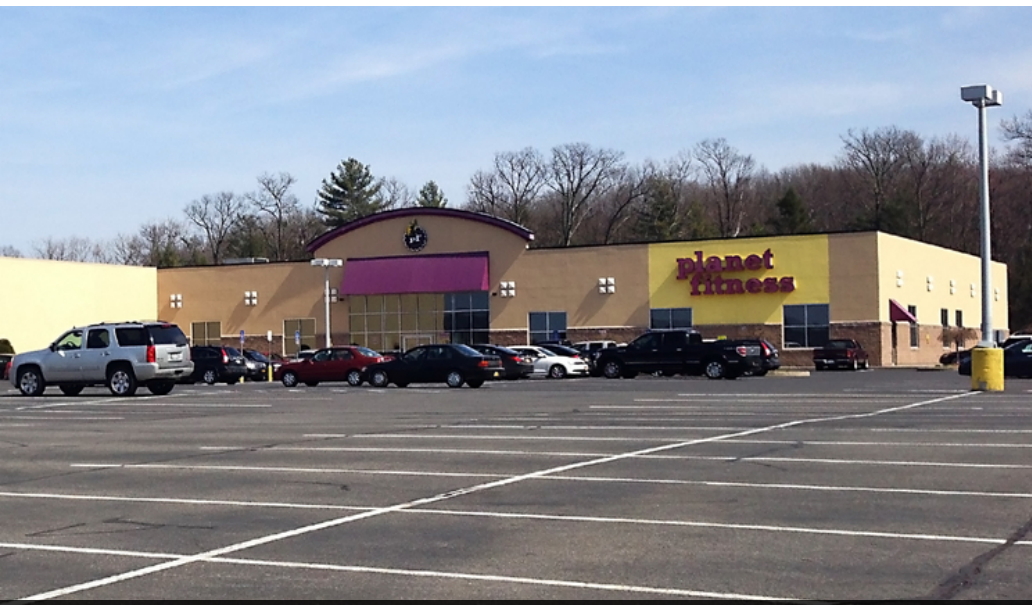
Planet Fitness Space