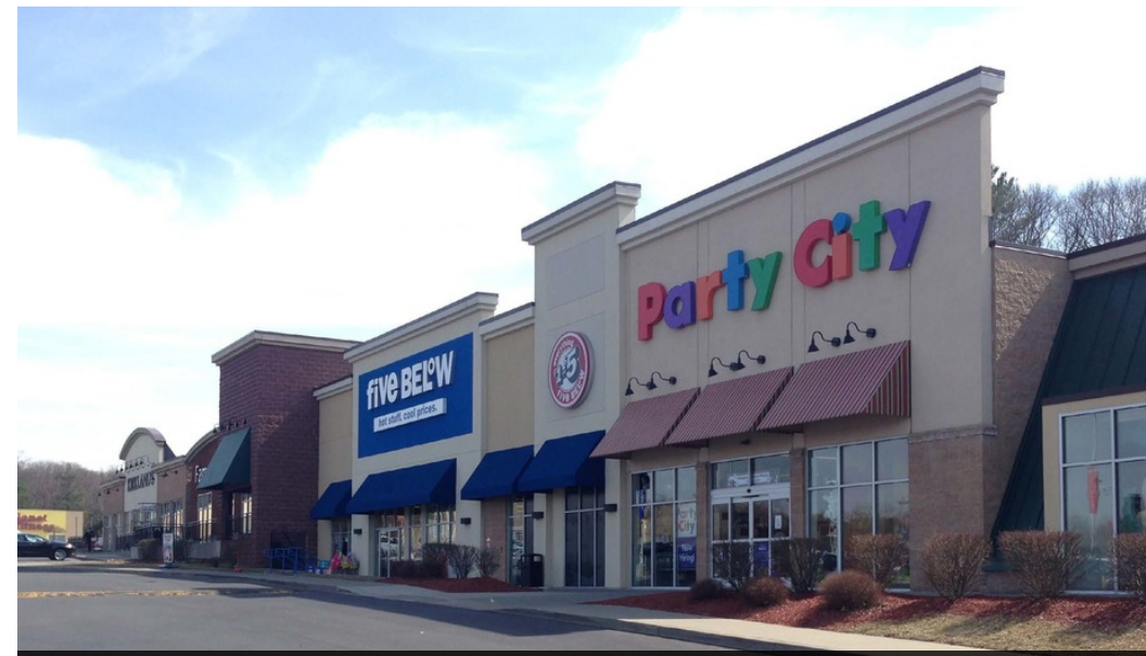
Party City and Five Below