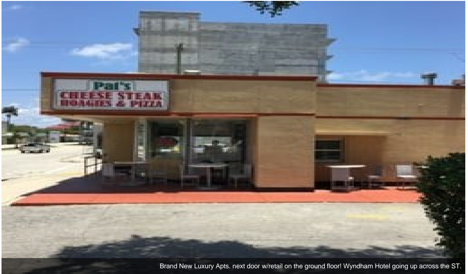
Brand New Luxury Apts. next door w/retail on the ground floor! Wyndham Hotel going up across the ST.