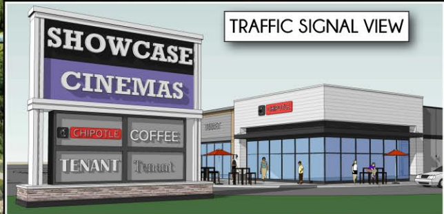
TRAFFIC SIGNAL VIEW