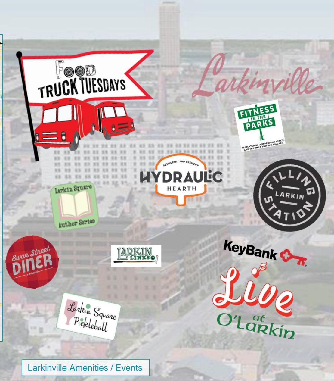
Larkinville Amenities / Events