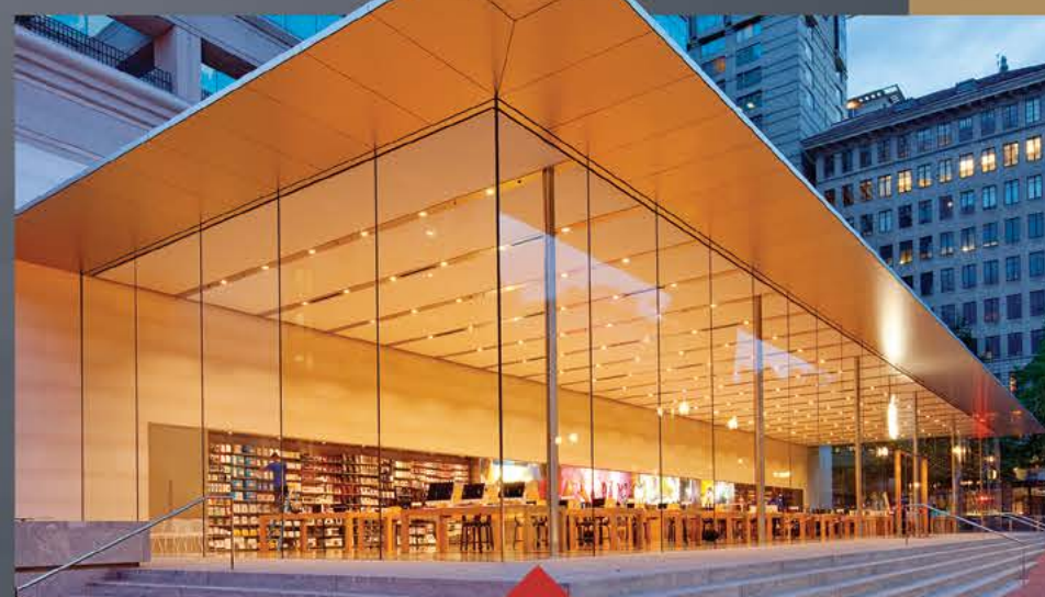
Brand new 34,000 SF premier Apple retail store, directly adjacent to Pioneer Tower.