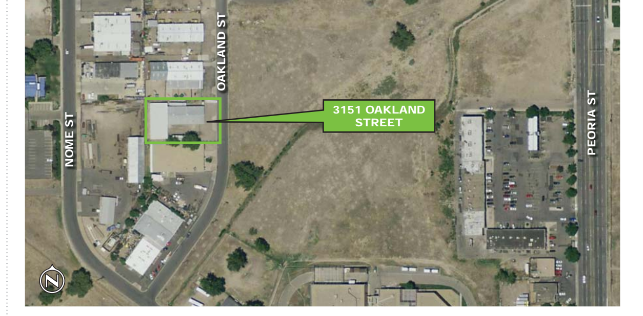
CBRE | 8390 E. Crescent Parkway | Suite 300 | Greenwood Village, CO 80111 | www.cbre.com/denver

© 2012 CBRE, Inc. This information has been obtained from sources believed reliable. We have not verified it and make no guarantee, warranty or representation about it. Any projections, opinions, assumptions or estimates used are for example only and do not represent the current or future performance of the property. You and your advisors should conduct a careful, independent investigation of the property to determine to your satisfaction the suitability of the property for your needs. Photos herein are the property of their respective owners and use of these images without the express written content of the owner is prohibited.