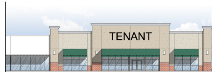
20,000 sf – One Tenant