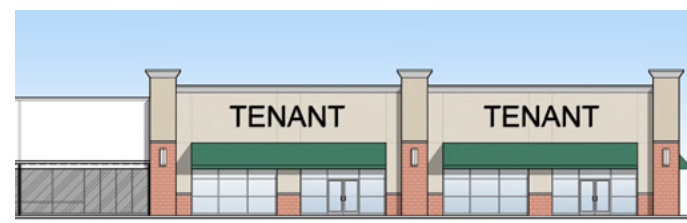
20,000 sf – Two Tenants